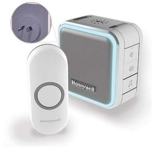
Series 5 Live Well Plug in