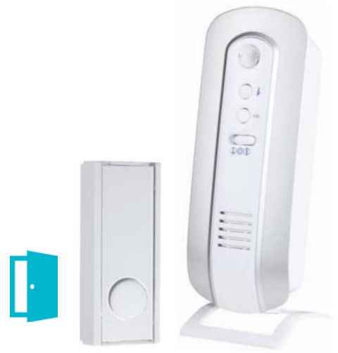
Decor Chime - White/Silver