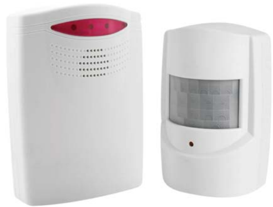
Entry Alert - Wireless PIR Alarm