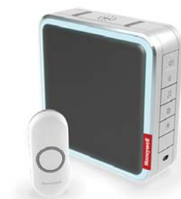
Series 9 Live Well Chime