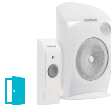
EVO+ 150M White Strobe

* Sound levels are measured in free field conditions.