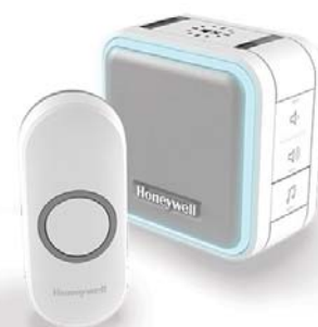
Series 5 Live Well Chime