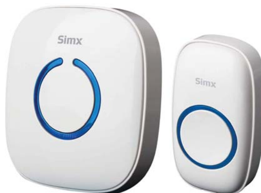
Square Plug-In Wireless Door Chime