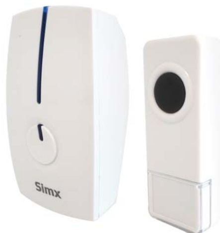
Rectangle Plug-In Wireless Door Chime