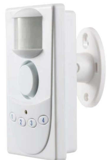
Password PIR Siren