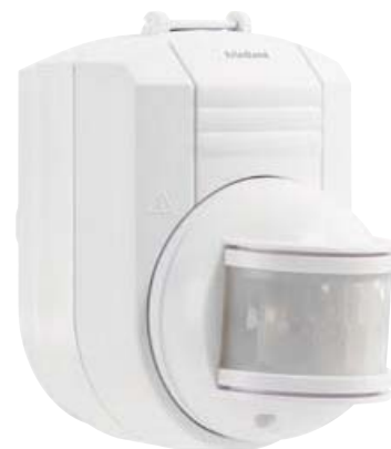
EVO+ Wire-free PIR