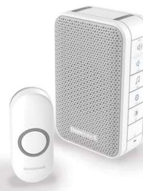
Series 3 Live Well Chime