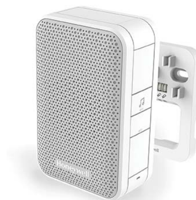
Series 3 Live Well