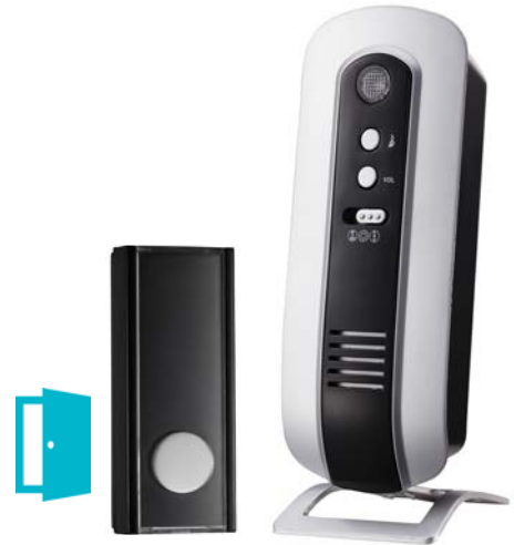
Decor Chime - Black/Silver