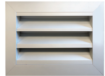
215 x 280mm Weatherproof Louvre Grille