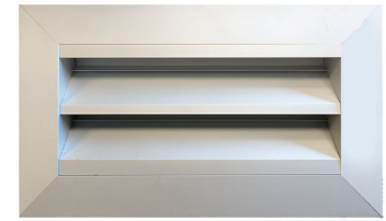
168 x 280mm Weatherproof Louvre Grille