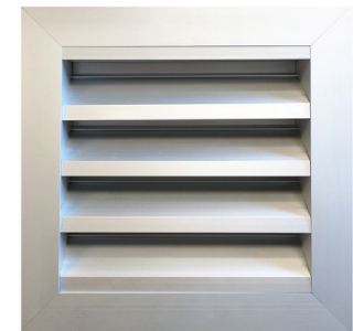
250 x 250mm Weatherproof Louvre Grille