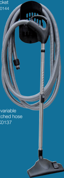
9m variable switched hose VAK0137