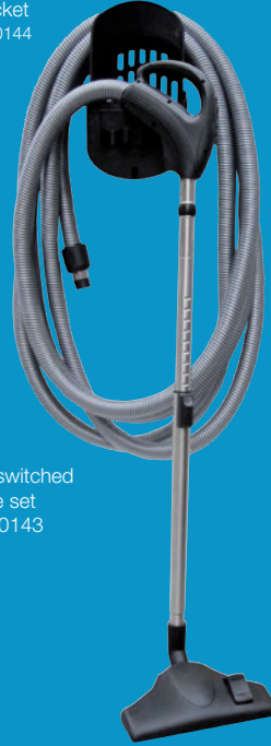
9m switched hose set VAK0143