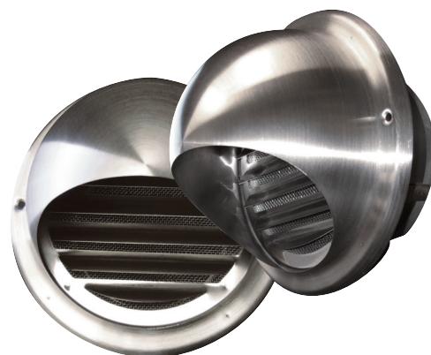
150mm Weatherproof - Stainless Dome Cowl