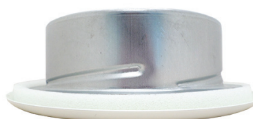
Tenmat Fire Diffuser