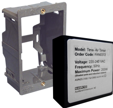
Small enough to fit into most common flush boxes.

In both cases all wiring and installation should be completed by a qualified electrician, complying with national wiring practices and using regulation terminal blocks to connect supply conductors.