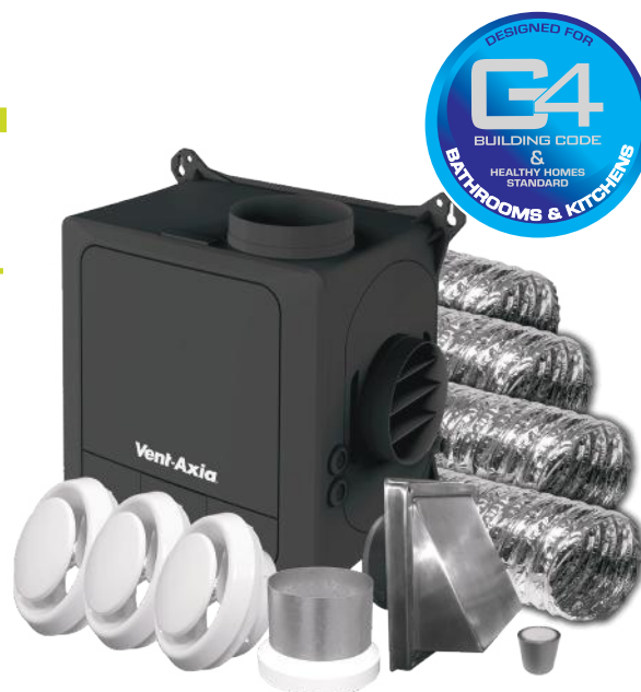
FAN7200 - Ventilation Kit FAN7453 - Fan Only Unit

Market leading Vent-Axia and Manrose extraction products are supplied and supported in the New Zealand market by Simx Ltd. Vent-Axia MultiVent systems have been proven and refined over decades in the UK and Europe.