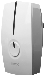
Receiver Indoor Chime Unit